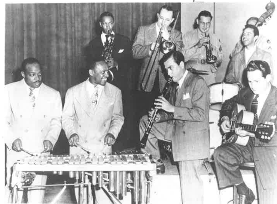
Lionel jams, circa 1942, with (L-R, First Row): Count Basie, Lionel, Artie Shaw, Les Paul. (L-R, Back Row): Illinois Jacquet, Tommy Dorsey, Ziggy Elman, Buddy Rich on drums, bass unknown.

February 28, 1987 The University of Idaho names its School of Music the "Lionel Hampton School of Music," the first School of Music in the world to be named after a jazz musician.