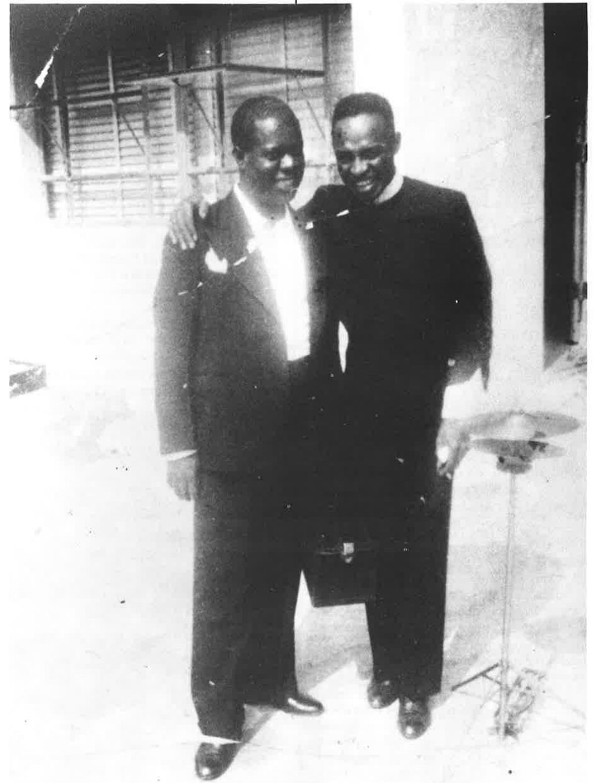
The Early Days- Lionel Hampton with Louis Armstrong. Lionel backed "Pops" in Los Angeles in the early 30's.