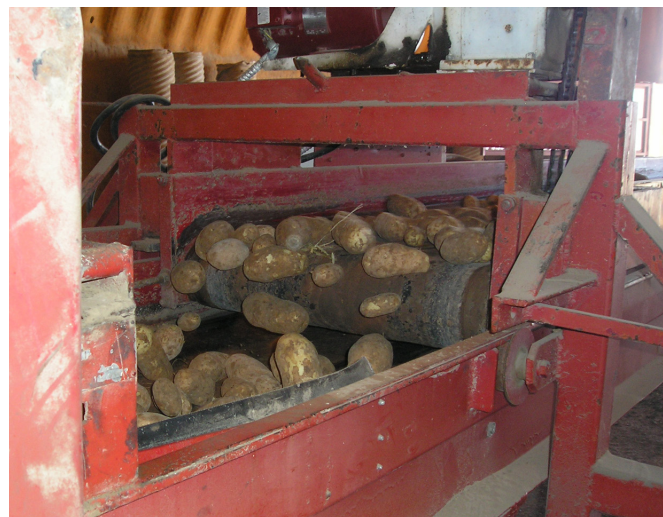
Potato handling equipment can be a serious source of contamination from adhering soil and debris. That's why thorough cleaning is advised before moving to new fields.

Note: Removing contaminated soil at a non-farm site is a very important practice to follow when purchasing, leasing, or borrowing used equipment.