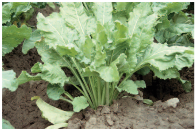
Figure 12: Example of excessive hilling caused by a dammer diker.