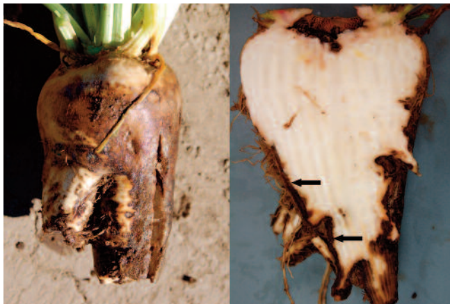
Figure 7: External and internal symptoms of crown and root rot. External infection (at left): infected root tissue is dark brown to black. Internal symptoms (at right): the margin between healthy and diseased tissues is sharply defined.

Root symptoms. General symptoms for crown and root rot include infected root tissue that is dark brown to black (figure 7). As the disease progresses, cankers and cracks may develop deep into the root, commonly on the side of the root or in the crown area. Brown fungal mycelium may be seen in these cracks. The pathogen can also attack the root in multiple areas, which may lead to numerous slightly sunken lesions on the root surface, either with or