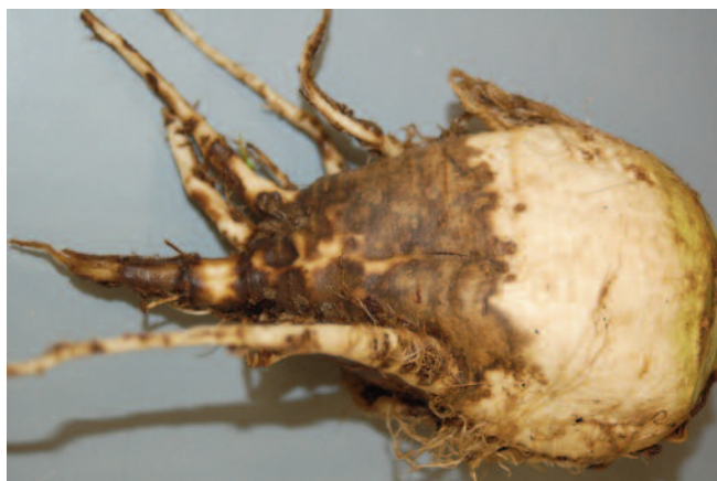
Figure 4: Sugar beet showing symptoms of tip rot. Symptoms start at the tip of the taproot and move upward.