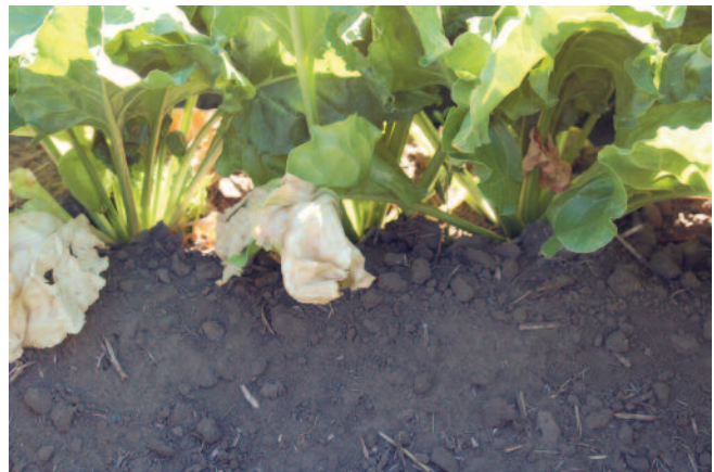
Figure 11: Example of excessive hilling in a surface irrigated field.

Soil compaction. Compacted soil greatly increases the incidence and severity of Rhizoctonia root rot. Soil conditions for optimal plant growth consist of