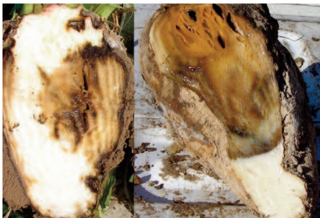
Figure 8: Internal symptoms of crown and root rot. The rotted root tissue is firm but may become soft as secondary fungi and bacteria invade following infection by Rhizoctonia solani .

without small cracks (figures 3 and 4). The margin between healthy and diseased tissue in the interior is sharply defined (figure 7) and will be dark brown to black.