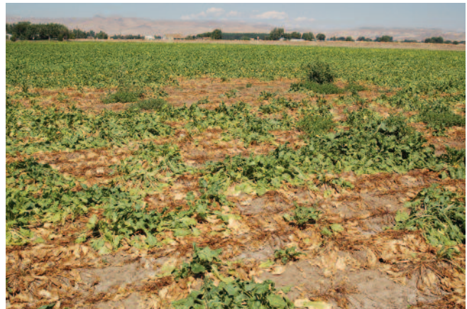
Figure 1: Sugar beet field heavily infested with Rhizoctonia solani .

The disease is most severe in warm temperatures (70–95 °F, 22–35 °C) in association with wet soil conditions. The causal fungus, Rhizoctonia solani , can also cause seedling diseases, primarily as post-emergence damping-off but also as pre-emergence damping-off. Because of cool soil temperatures at normal planting dates, R. solani damping-off is a minor problem in the Northwest, and