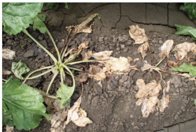
Figure 6: Infected petioles remain attached to the crown after they die and form a rosette of dead, brown to black leaves.