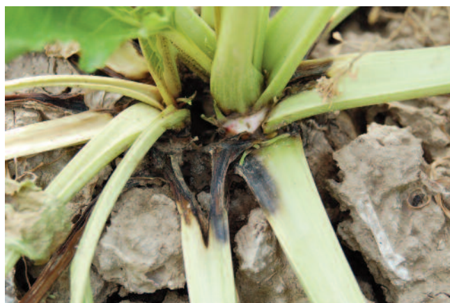
Figure 5: Crown and root rot symptoms can include dark brown to black lesions at the base of infected petioles.

Foliar symptoms. The first aboveground symptoms for both forms of Rhizoctonia crown and root rot are stunted