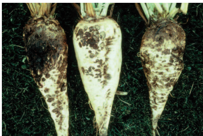
Figure 3: Sugar beet showing early (middle) and advanced (left, right) symptoms of crown rot. External symptoms include dark brown to black discoloration of the root surface closest to the crown that moves downward over time.

Seedlings infected with R. solani show symptoms resembling water soaked, darkened tissue, starting below the soil surface and eventually spreading up to the hypocotyl. Seedlings generally wilt, and they often die.