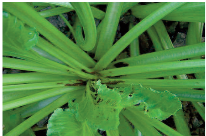
Figure 2: Rhizoctonia foliar blight as seen under warm, wet weather conditions.

other fungi are usually responsible for seedling disease. However, R. solani can cause seedling disease when the crop is replanted at a later planting date when soils are warmer. Under warm, wet weather conditions, Rhizoctonia foliar blight (figure 2) can occur, but it is not considered to be of economic importance in the Northwest.